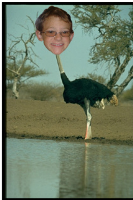
The very rare Pjostrich. Found only at Tavelli Elementary School.