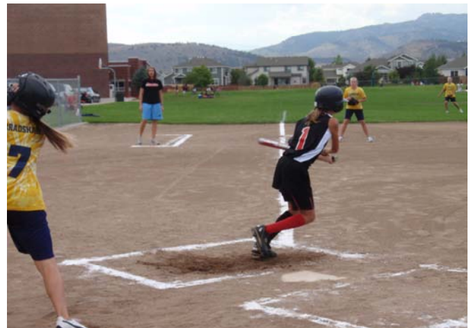
Headed for first base...