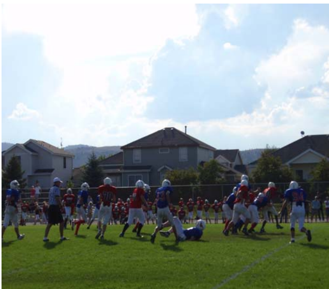
Tackled after a great run...